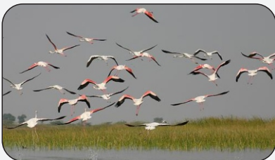
Kusheshwar Asthan Bird Sanctuary